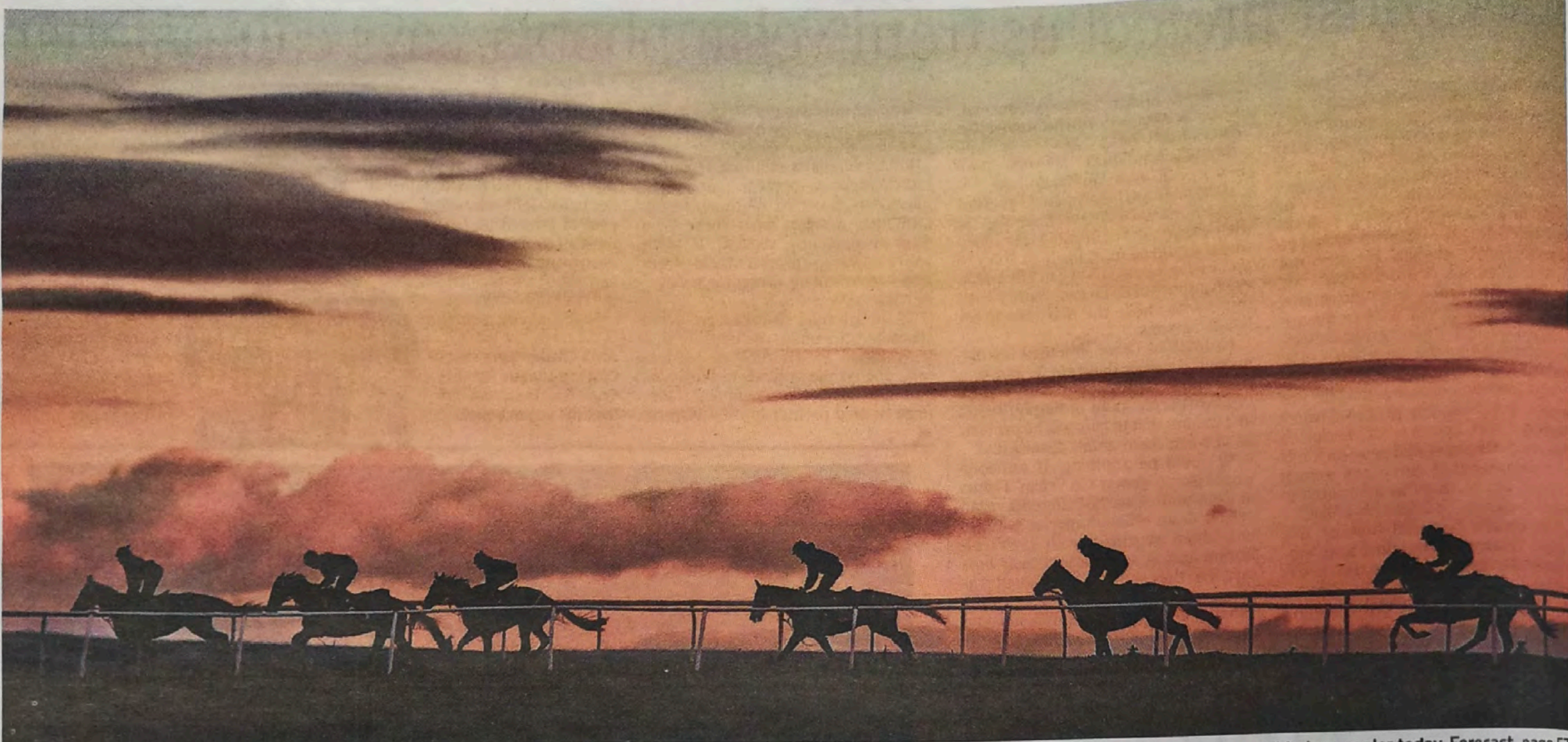
Dawn patrol Riders take to the gallops to train racehorses on Middleham Low Moor as the sun rises on a mild day in Wensleydale, North Yorkshire. Temperatures are set to turn cooler today. Forecast, page 57